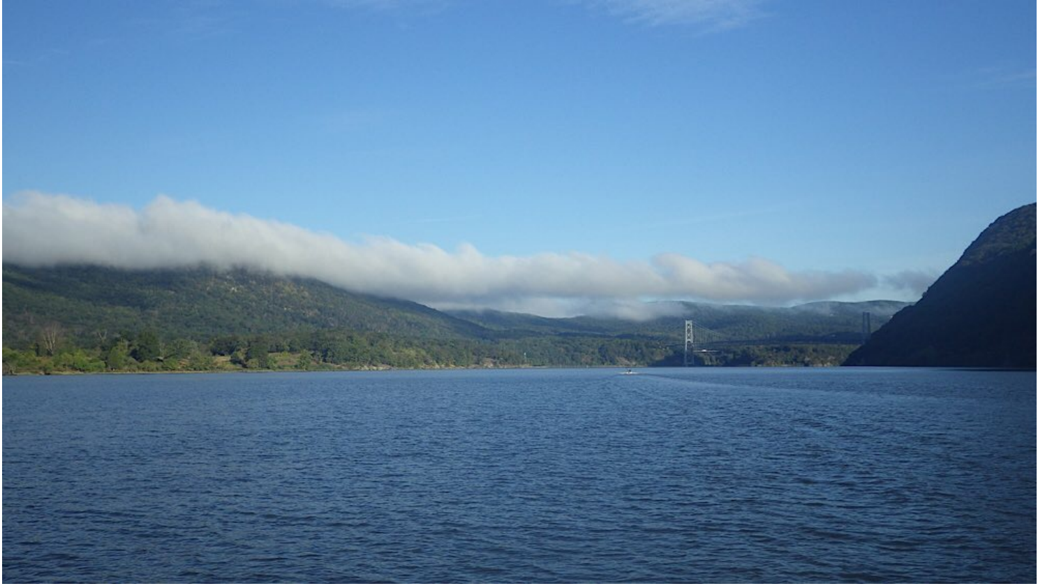
Bear Mountain bridge