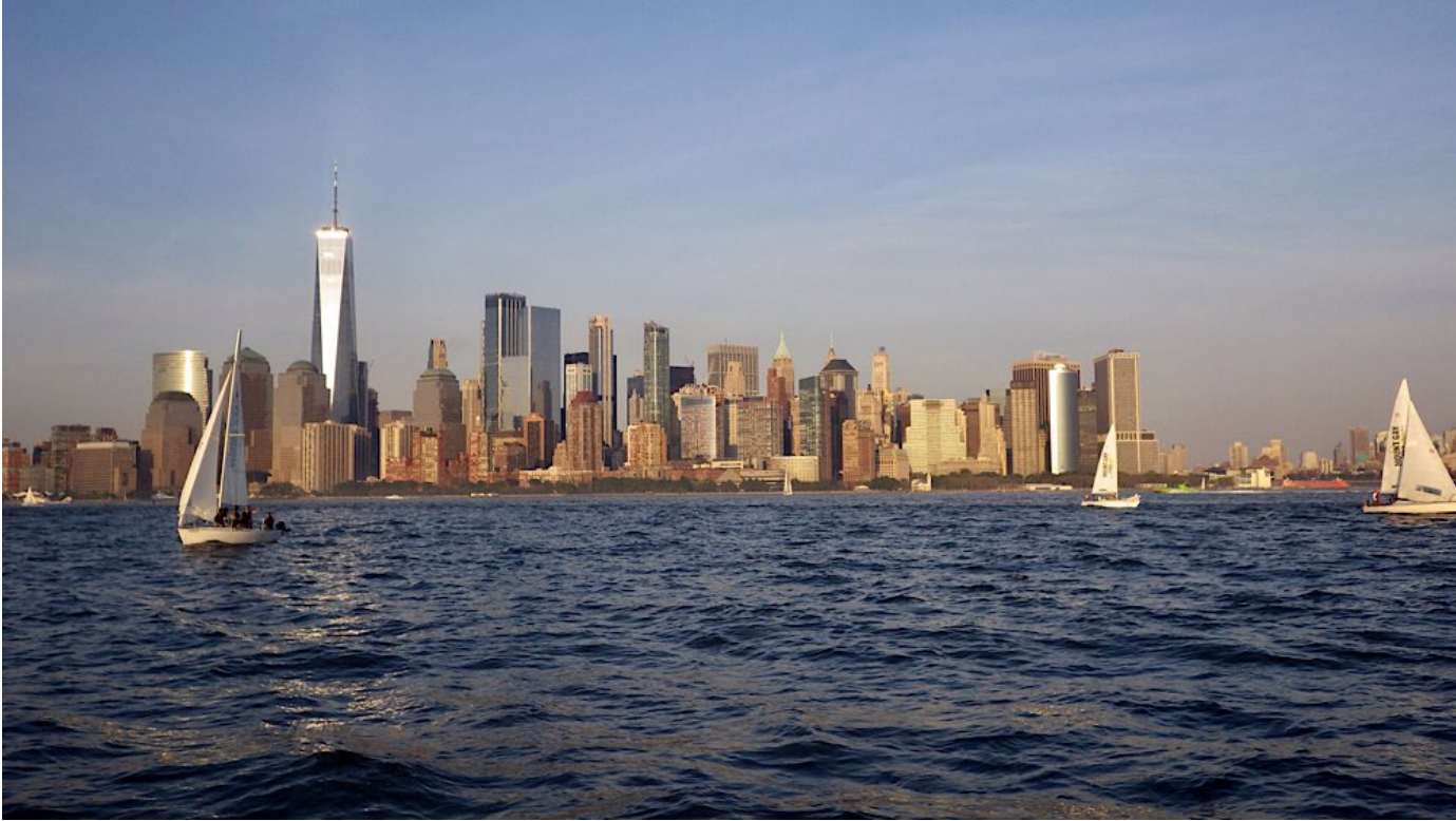
New York and our fabulous view from the anchorage at Ellis Island